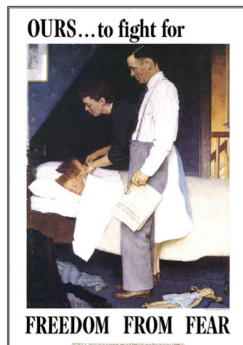
The Four Freedoms series. 1943

...EVEN IF IT WASN'T AN IDEAL WORLD, IT SHOULD BE AND SO I PAINTED ONLY THE IDEAL ASPECTS OF IT.